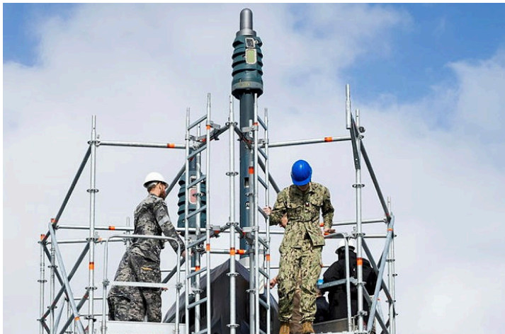
Australian, US service personnel sharing vessel maintenance tasks

For further details, see our media release .