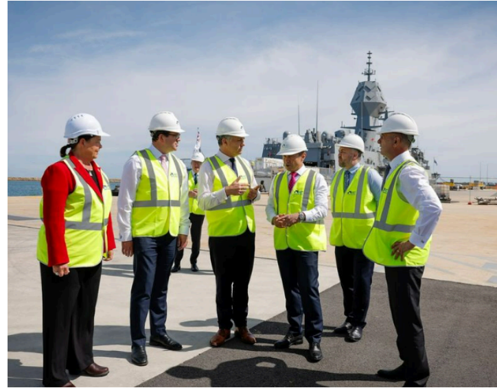
Deputy Prime Minister and Minister for Defence, The Hon Richard Marles MP announces new investment at Henderson in partnership with WA Government

Further details are available at our media release .