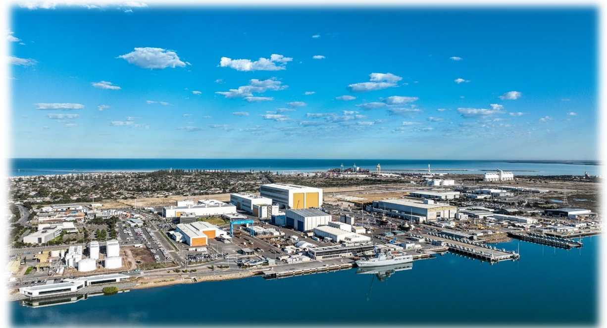
Aerial view looking west towards Osborne Naval Shipyard