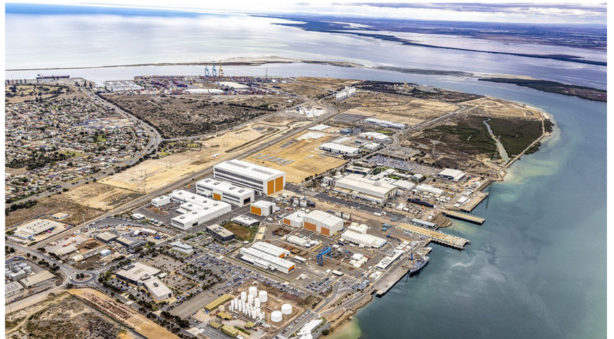
Looking north over the Lefevre Peninsula.

Over the next few years, it is estimated at least $2 billion will be invested in South Australian infrastructure. At its peak, the design and build of the infrastructure for the Osborne Submarine Construction Yard is expected to employ up to 4,000 workers – almost double the workforce forecast for the Attack Class program.