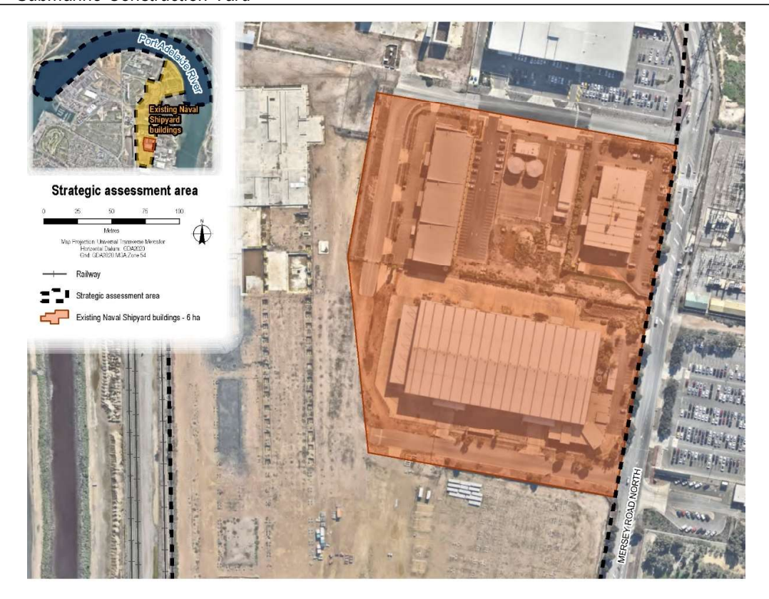
Figure 2 : Existing Naval Shipyard Buildings within the Strategic Assessment Area on the Lefevre Peninsula, Osborne, South Australia.